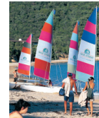
Genuine supplies print