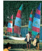
Non-genuine supplies print